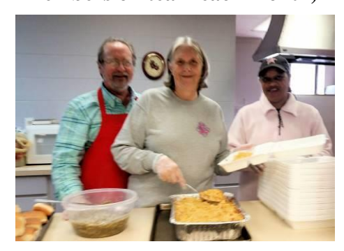
SAWA Team (rotating Members on team each month)